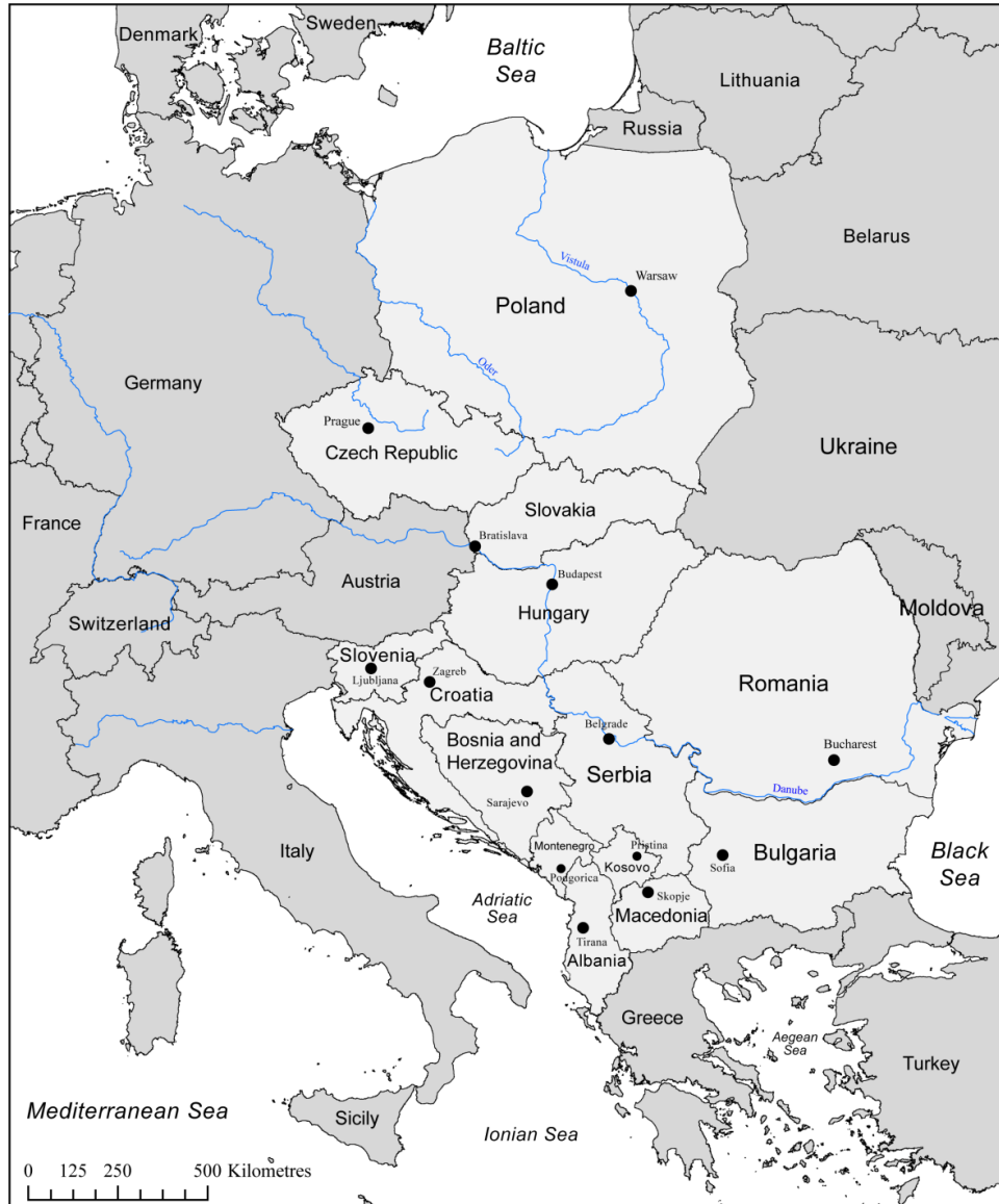
Map 1.1: Political and Administrative Map of Central and Eastern Europe

Map 1.1 illustrates the political and administrative borders of East-Central European countries. For many Eastern European countries, the end of communism brought an opportunity to embrace a revitalized global neo-liberalism and the new economic and political opportunities it portended. In this view, the end of communism ushered in a period of great hopes of a return to Europe; a return that would expand economic opportunity and open personal and political freedoms (Pickles, 2005). At the same time, and in support of these developments, ‘theory’